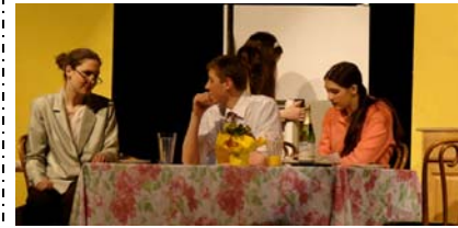
The Drama Squad made it to the state semi-finals with their performance of Rabbit Hole in March (above).