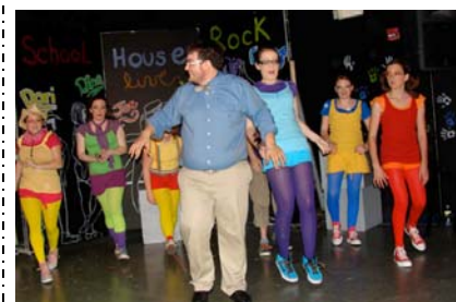
In May, School House Rock Jr. attracted all ages to the Black Box (below).